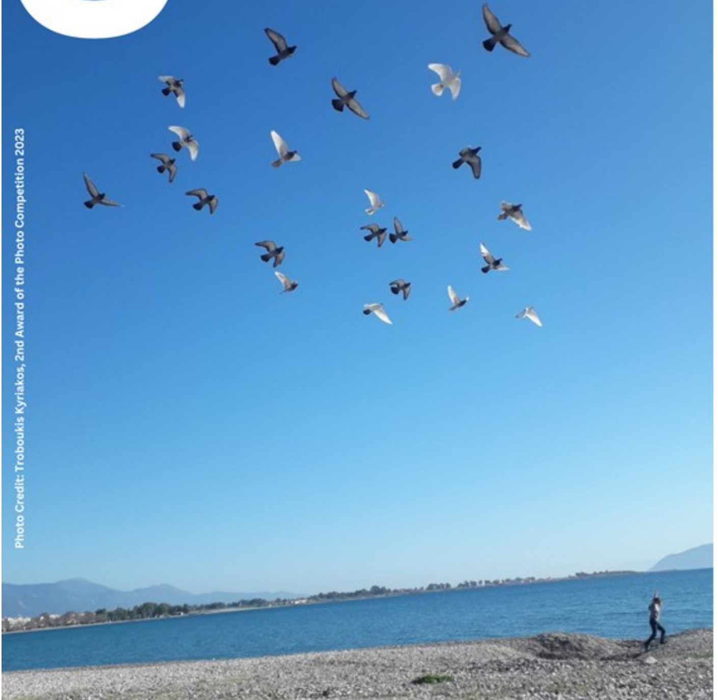
2nd Award of the Photo Competition 2023

Reflection of Disability in art 3-10 December 2023